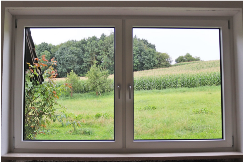
bedroom 1, view into the garden