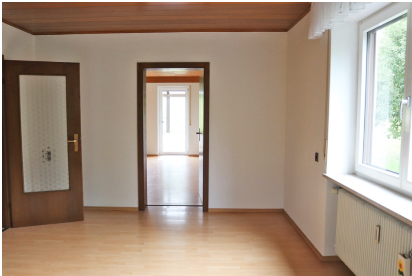
kitchen, view into living room