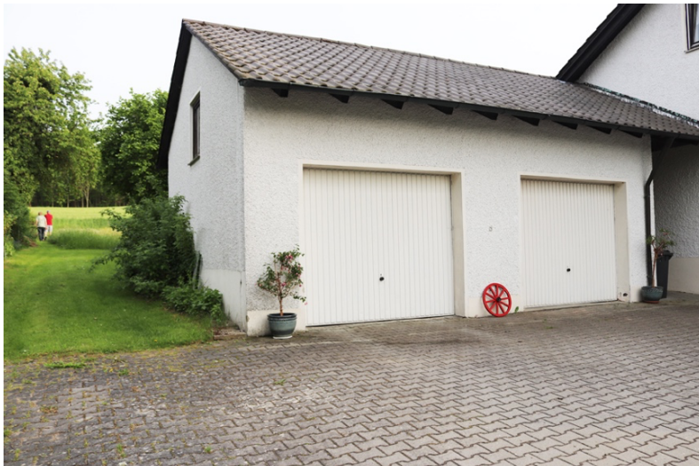
2 garages with attic