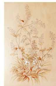
details in country house style