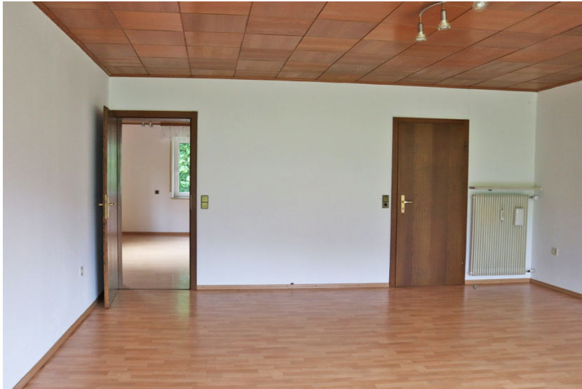
living room, view into kitchen