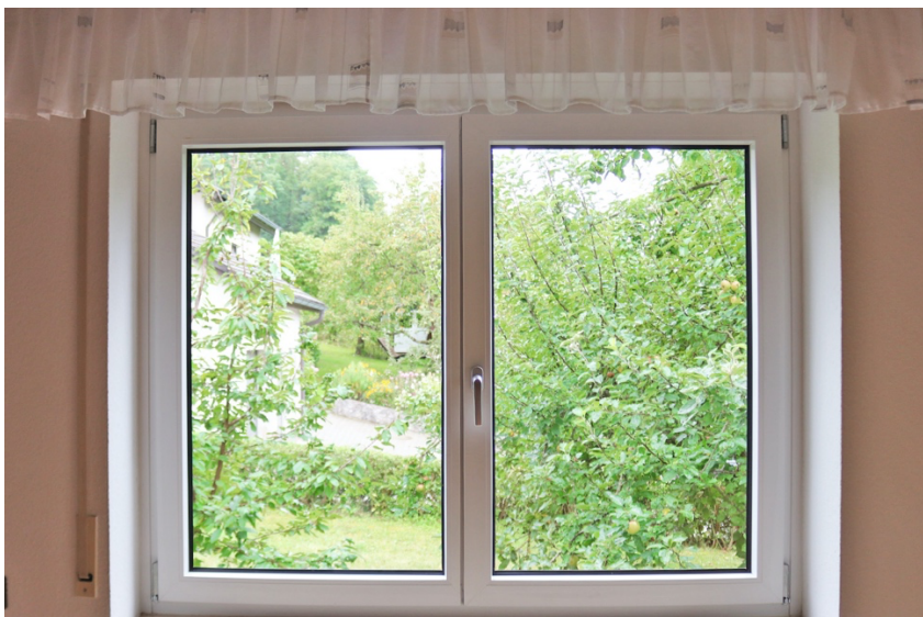
kitchen, view from window into the garden