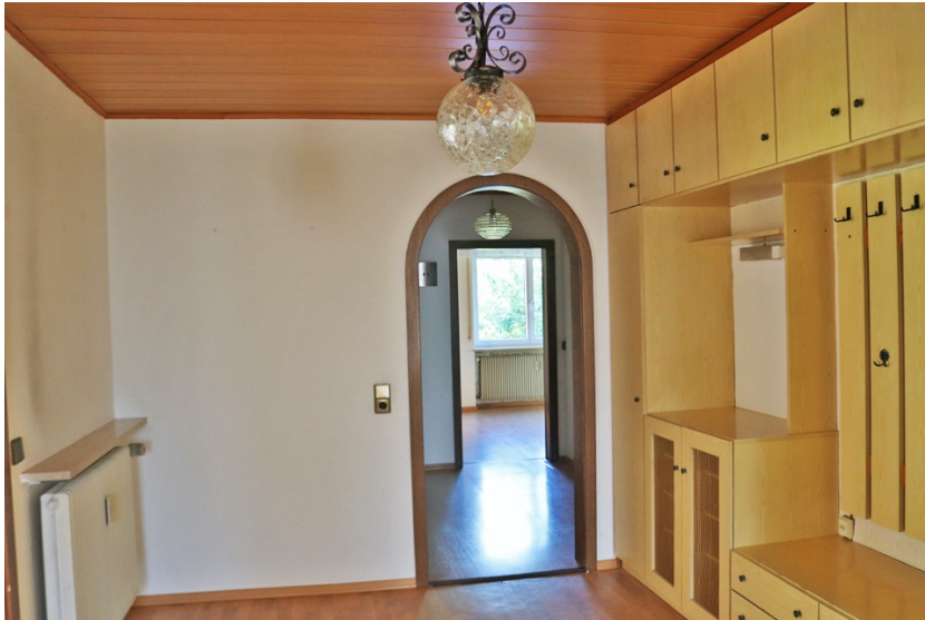
hall with built-in-closet