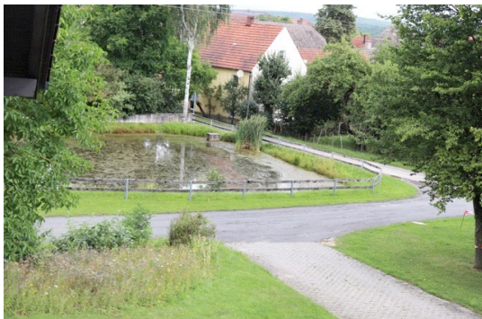
view from entrance: village pond