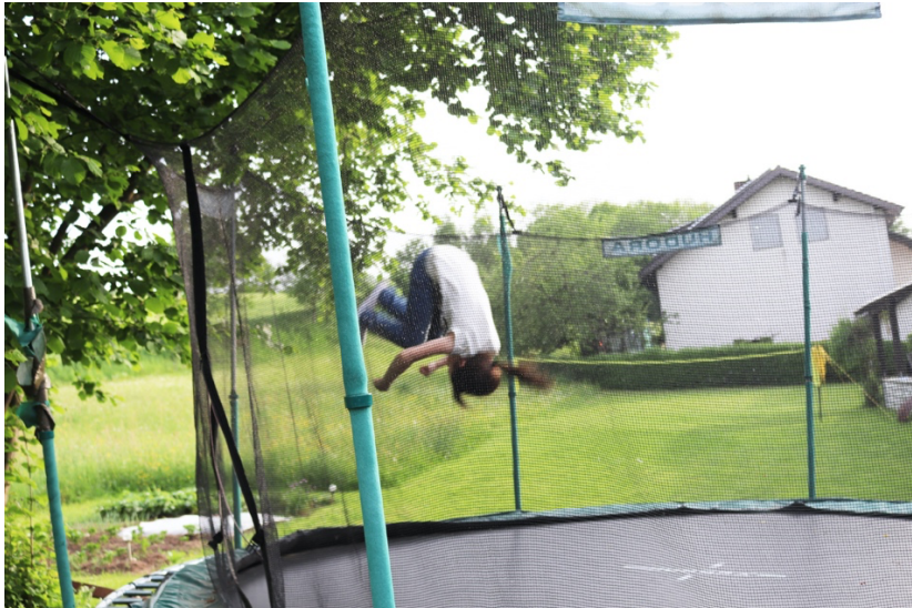
space for children's play equipment such as trampolines