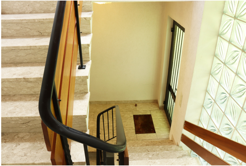
entrance and stairway