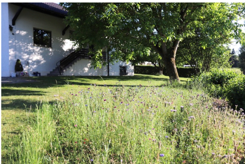
entrance, front lawn with walnut tree