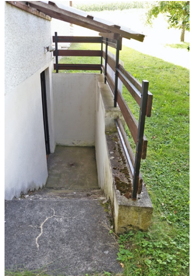
exit basement into the garden