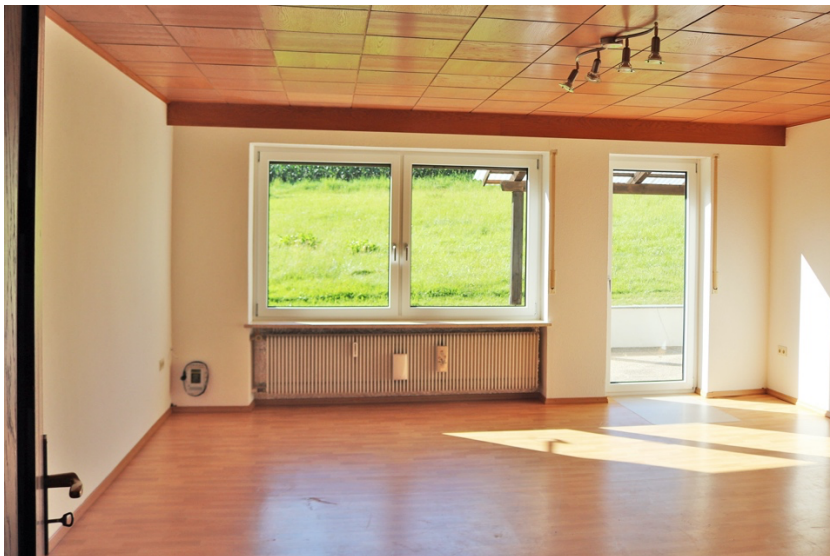
living room, view on terrace