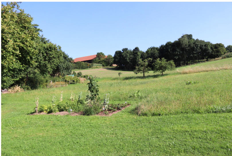
vegetable garden – view from terrace