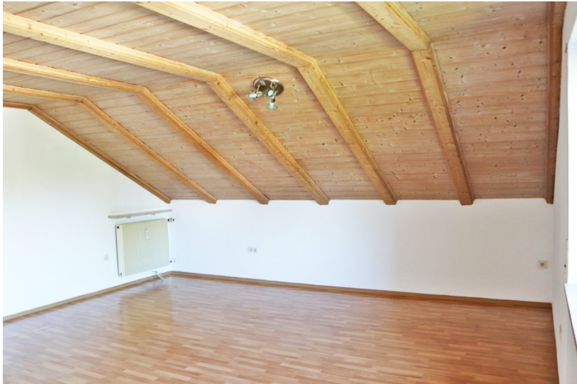
bedroom 1 with balcony