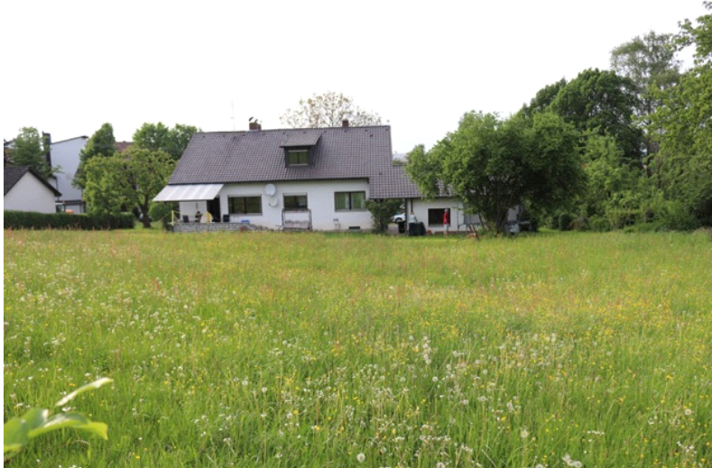
backside with terrace