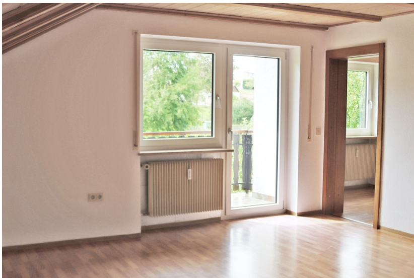
bedroom 1 with balcony